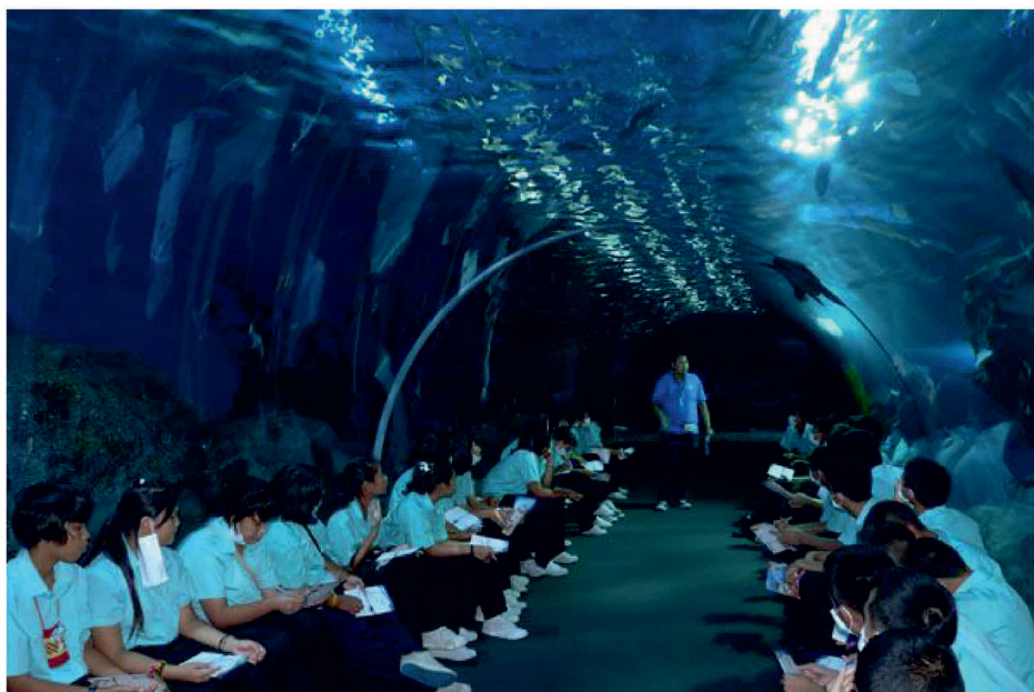
Fig. 1. Schooling in a glass “submarine” tunnel in Siam.

pupils and students to close observation followed by the expression of the observed so that the description is neither elemental nor mentioning only most striking aspects, which could be insignificant. To avoid superficial descriptions, students must be guided to detailed observations to notice inconspicuous feature escaping the first look. One of such teaching methods can be identified in Fig. 1, where a group of students from Siam observes sea creatures in an 83 m long submarine tunnel (E-akvárium, 2017).